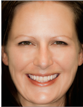
REPOSE (Pre-Op Lip Line)