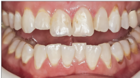
Temps Retracted View-Open