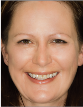
FULL FACE (Temps Lip Line)