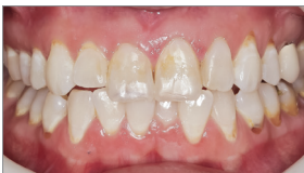
Temps Retracted View-Closed